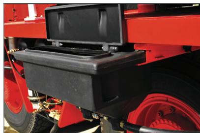
Pull out sander boxes with wide mouth lids for easy loading. Air activated sanders for smooth dispensing.