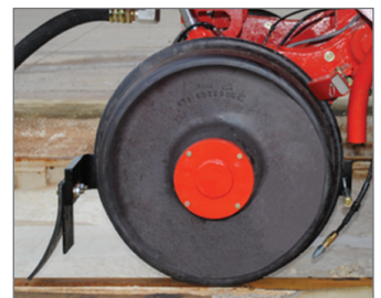
Powerful air knife increases capacities up to 50% in adverse weather.

For narrow or wide applications: Please consult with factory. *Note: Tractive effort may vary with rail and weather conditions. Dimensions and Weight do not include optional equipment. Specifications are subject to change without notice.