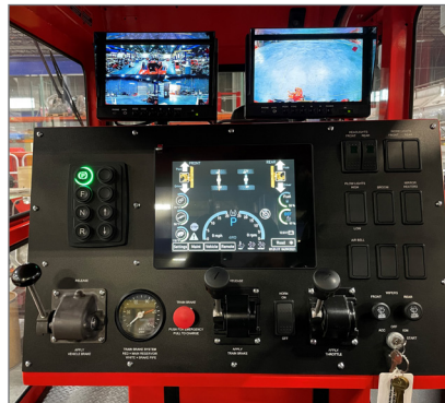
180-degree rotating console with multifunction display. Dual four-way air suspension seats for operation from either side of cab in rail mode. Shown with 4-camera surround.